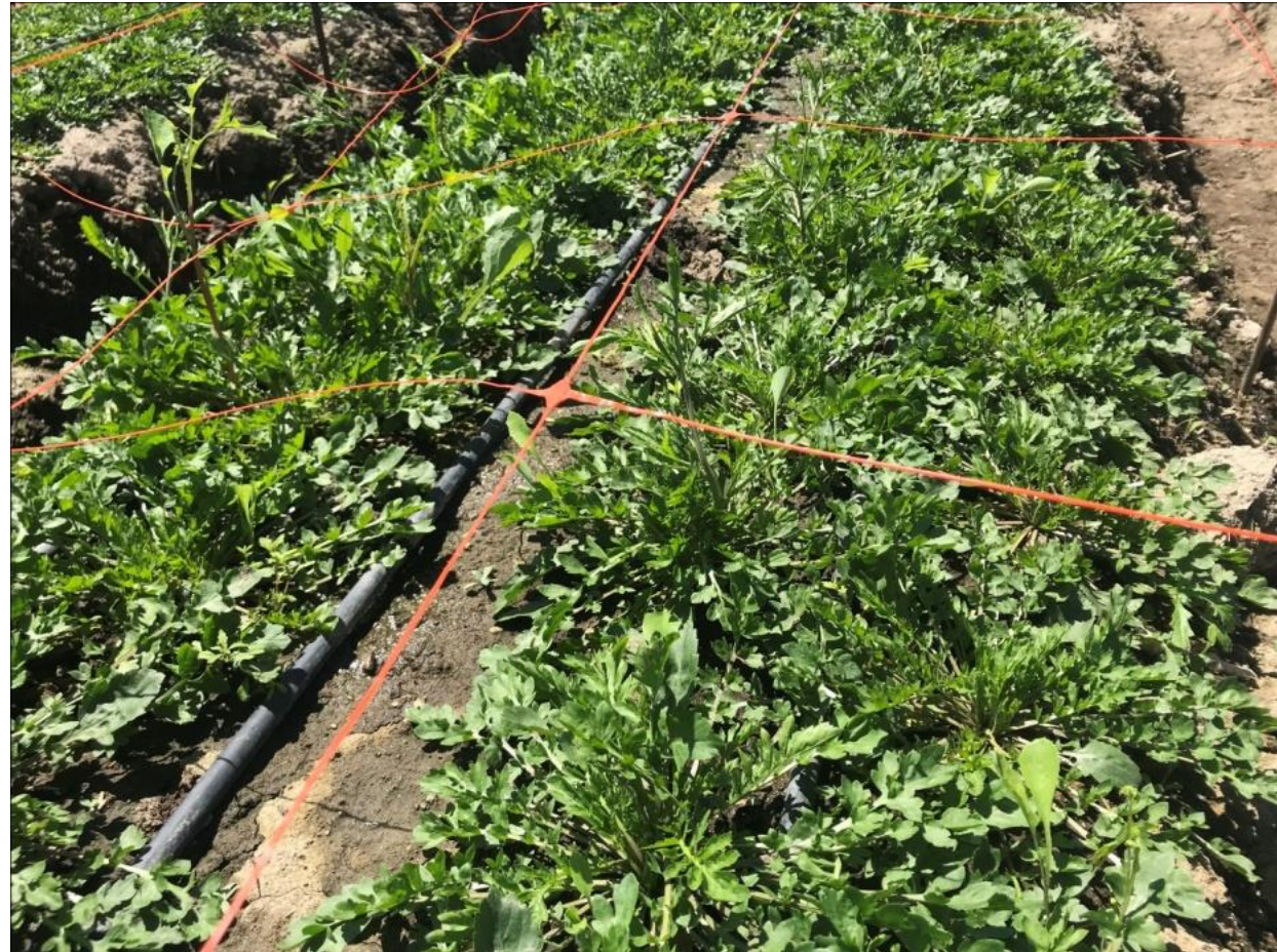
Plants after an insufficient GA application