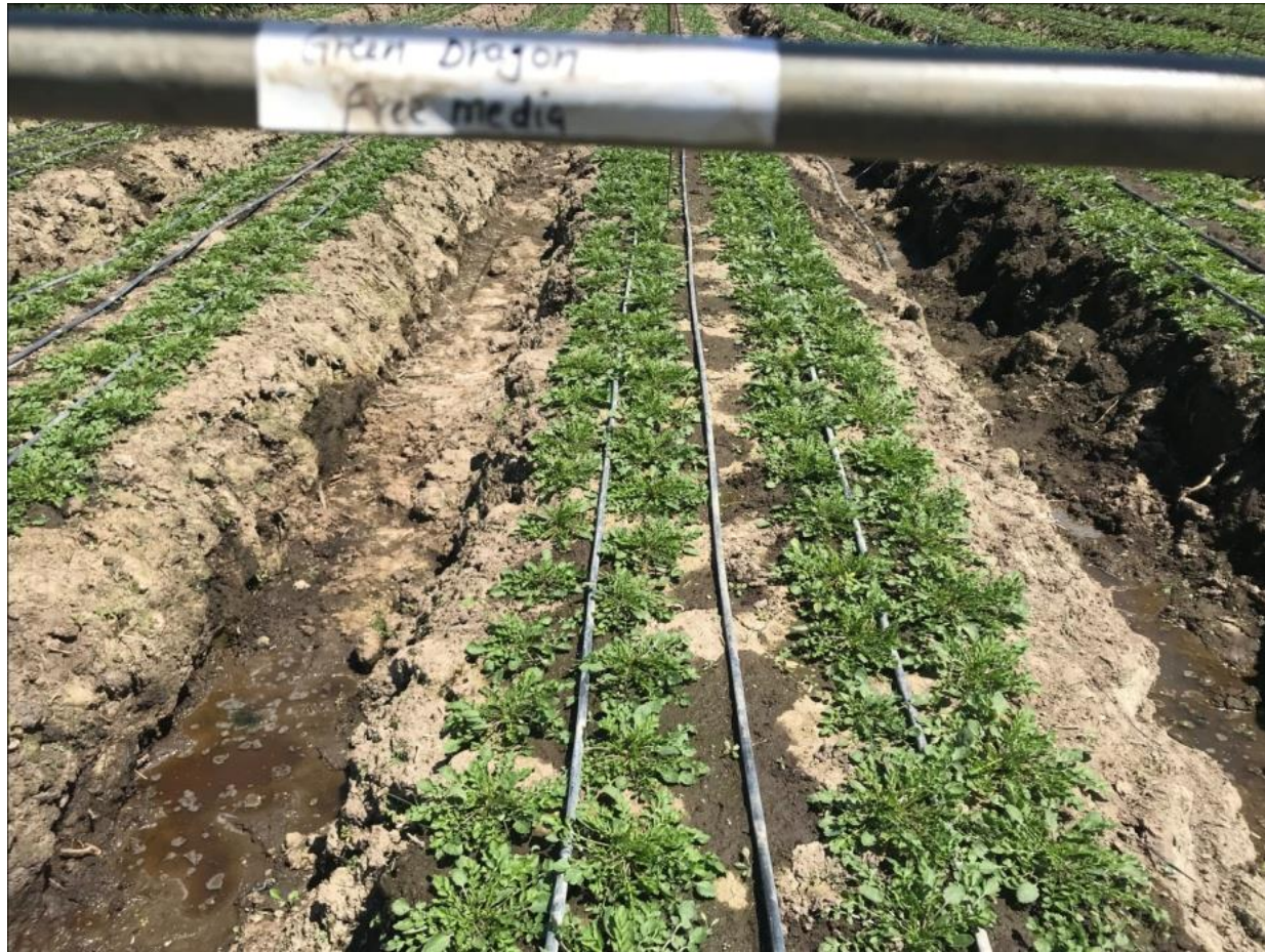
Plants ready for GA treatment