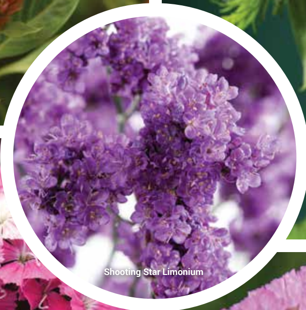
Shooting Star Limonium