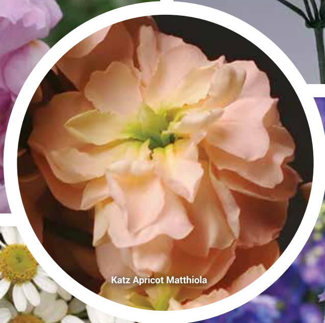
Katz Apricot Matthiola