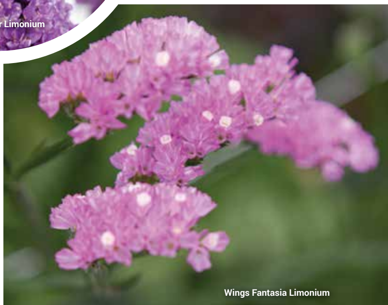
Wings Fantasia Limonium

Quality inputs and a diverse selection are the cornerstone to a successful cut flower farm - the tried and true as well as the new and different. Explore the many options here and on WebTrack to grow your business.