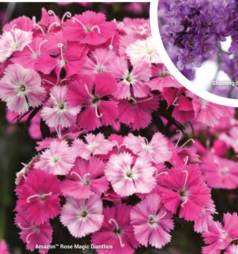
Amazon™ Rose Magic Dianthus