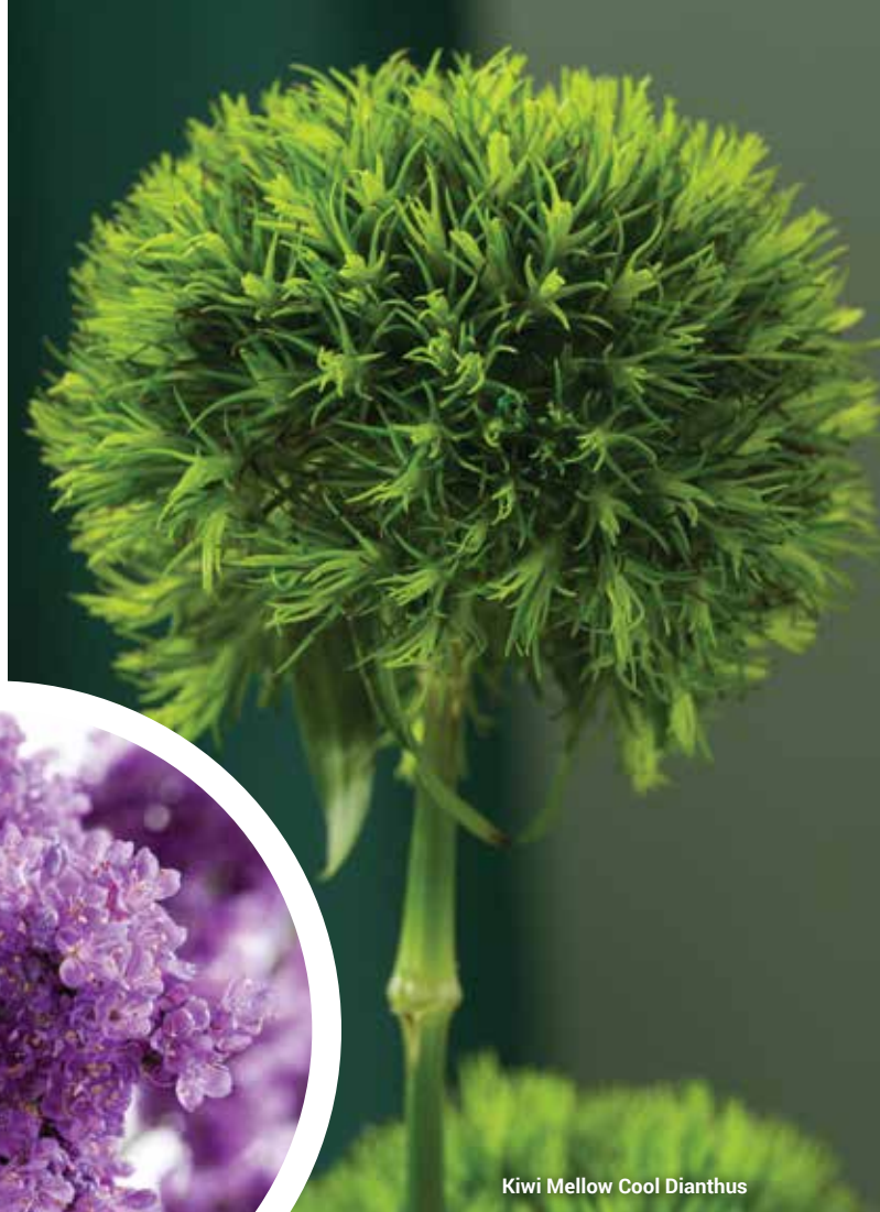
Kiwi Mellow Cool Dianthus