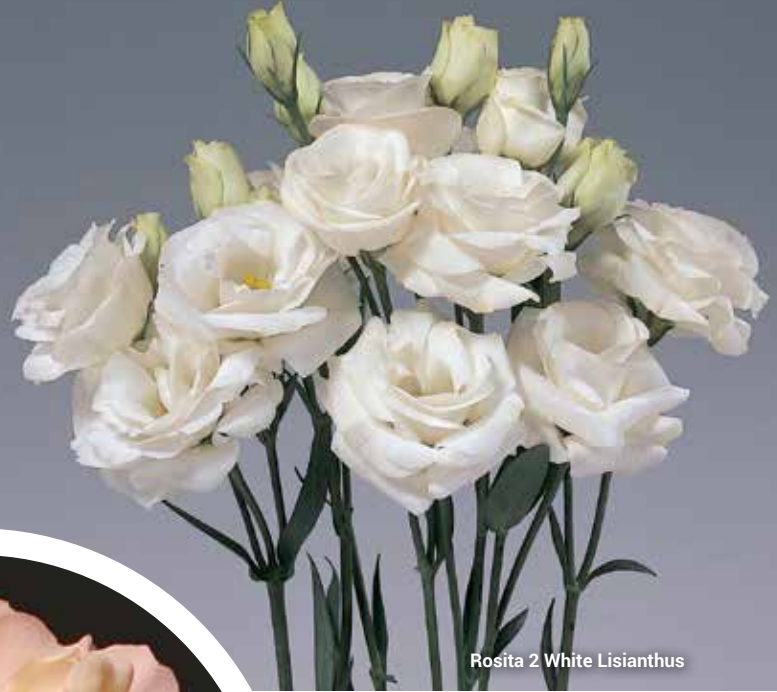
Rosita 2 White Lisianthus