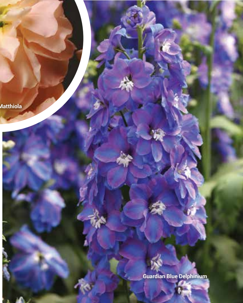
Guardian Blue Delphinium