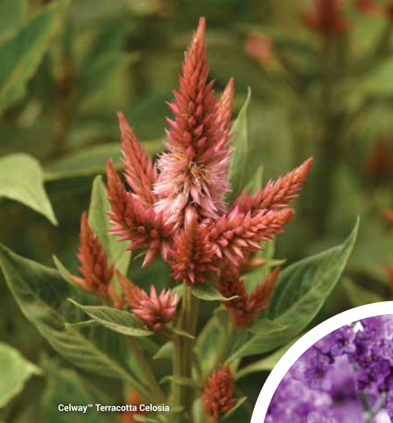
Celway™ Terracotta Celosia