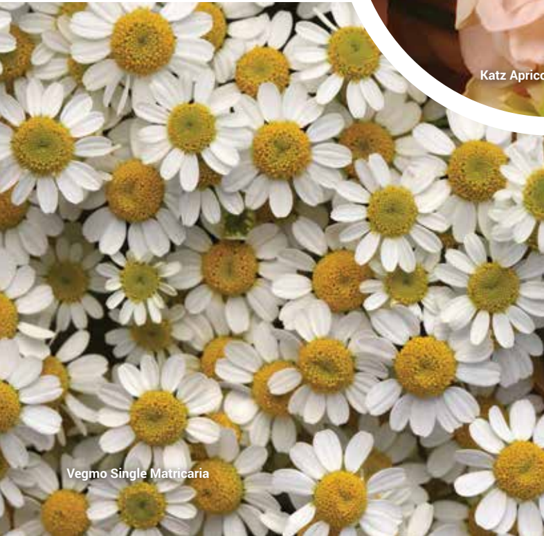
Vegmo Single Matricaria