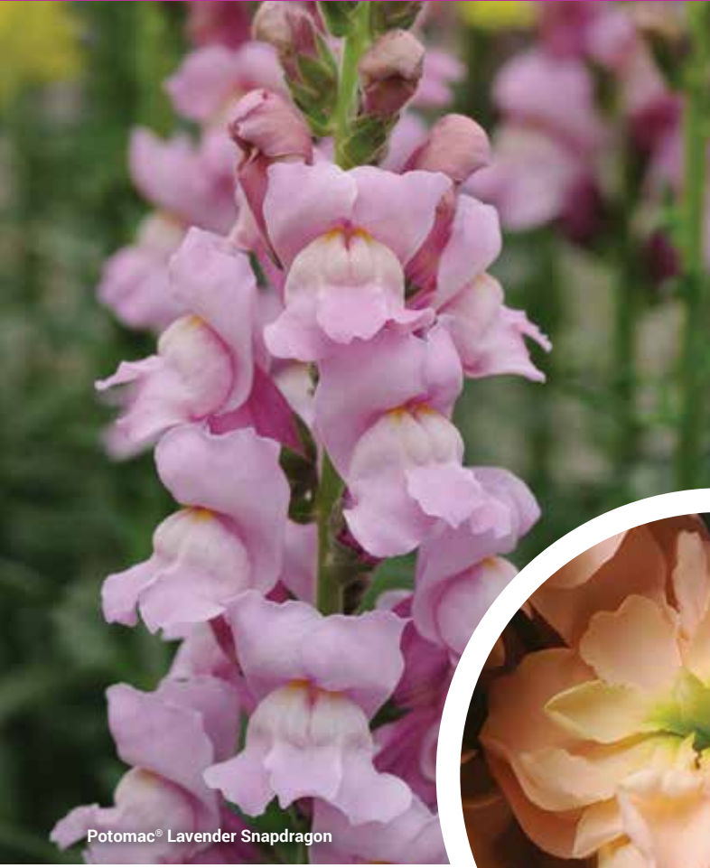
Potomac® Lavender Snapdragon