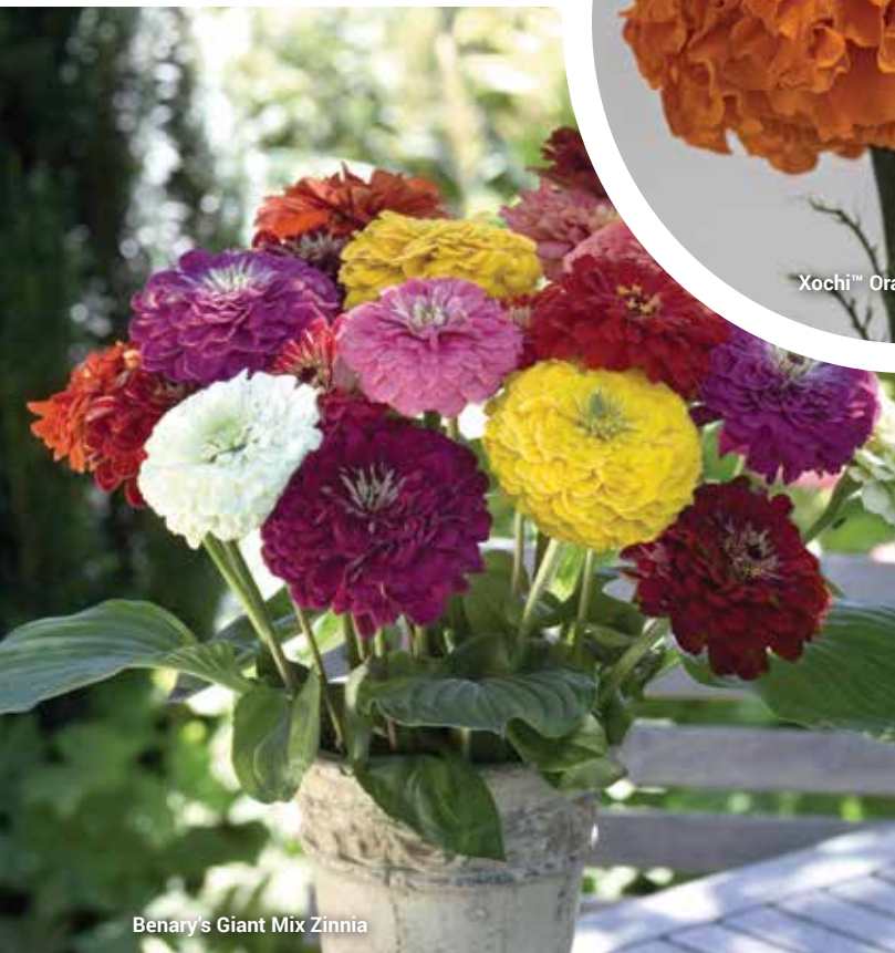
Benary's Giant Mix Zinnia