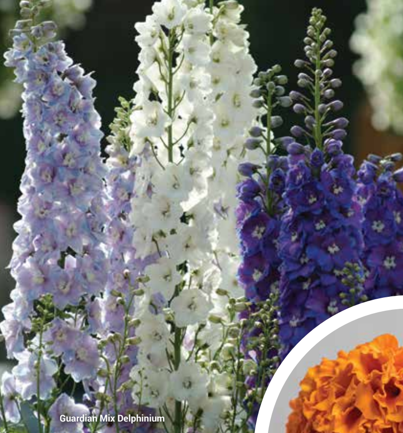
Guardian Mix Delphinium