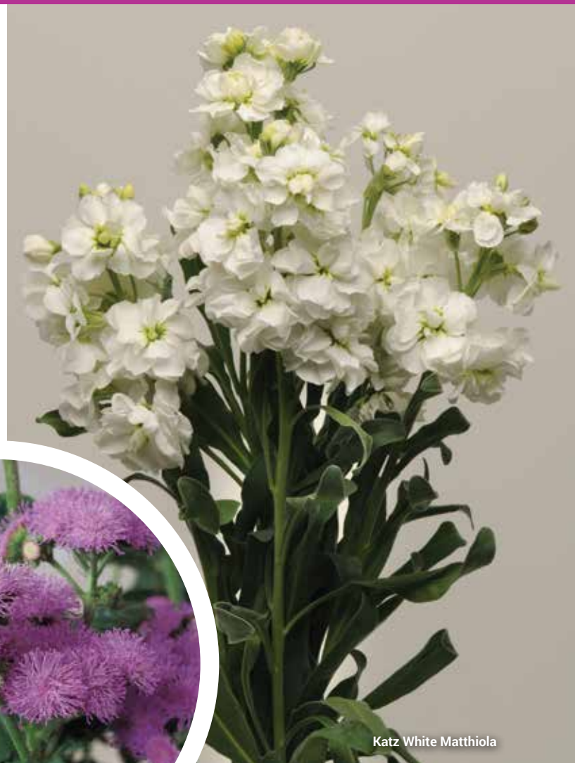
Katz White Matthiola