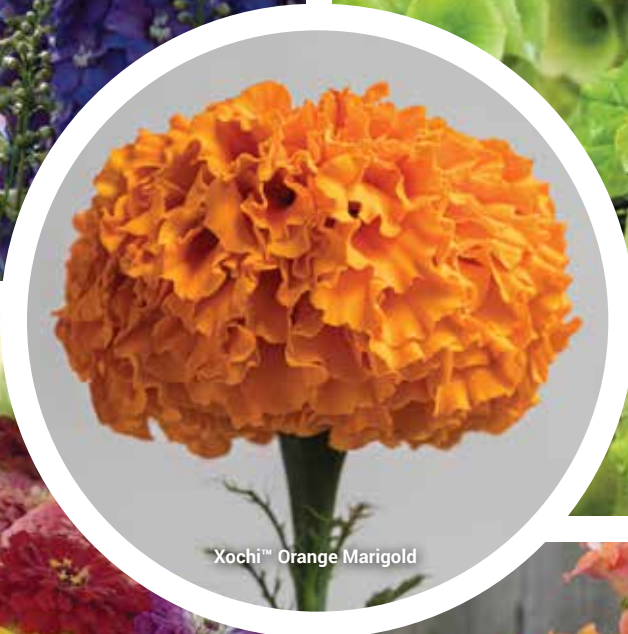
Xochi™ Orange Marigold