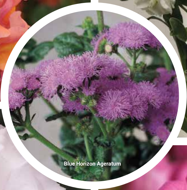
Blue Horizon Ageratum