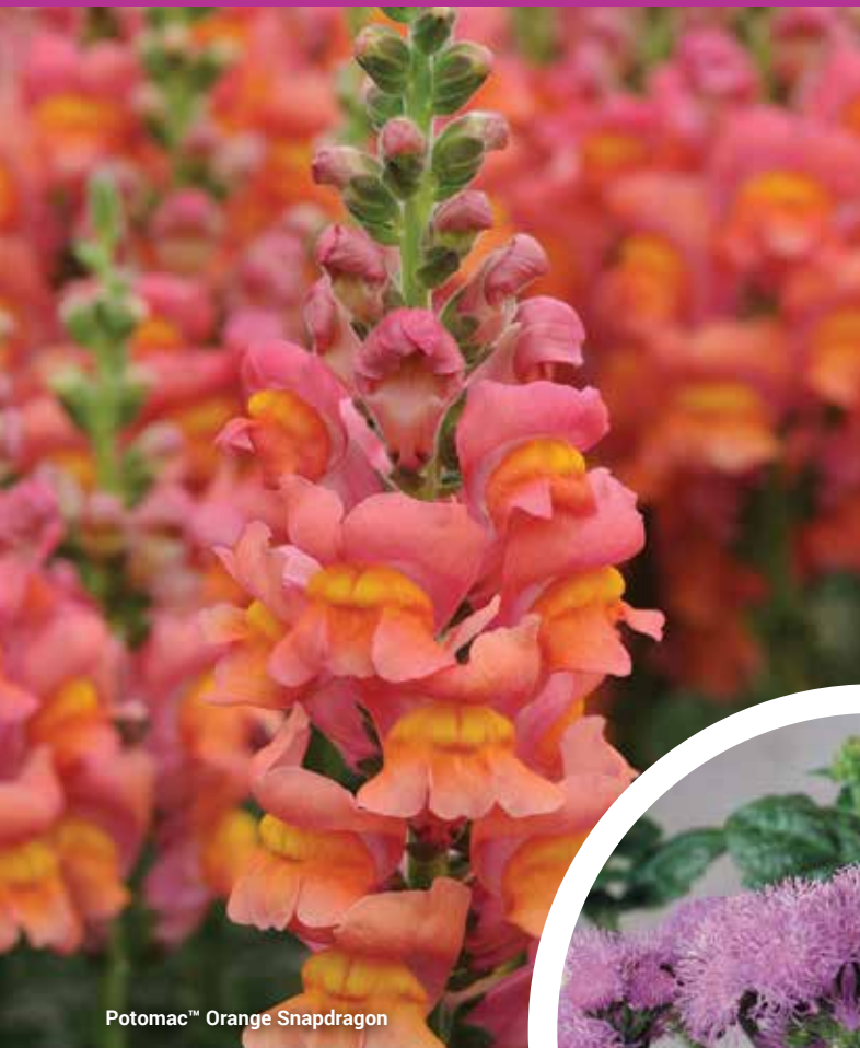
Potomac™ Orange Snapdragon