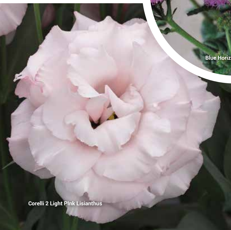
Corelli 2 Light Plnk Lisianthus