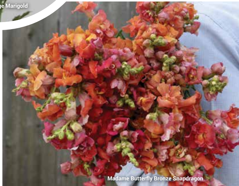
Madame Butterfly Bronze Snapdragon

Quality inputs and a diverse selection are the cornerstone to a successful cut flower farm - the tried and true as well as the new and different. Explore the many options here and on WebTrack to grow your business.