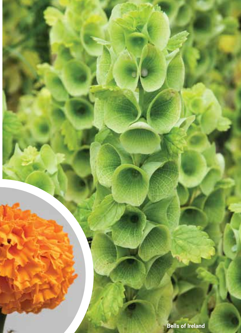
Bells of Ireland